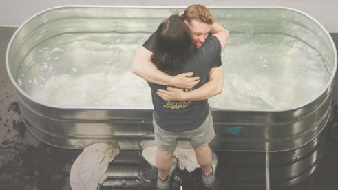
Annie Armstrong Easter Offering | North American Mission Board